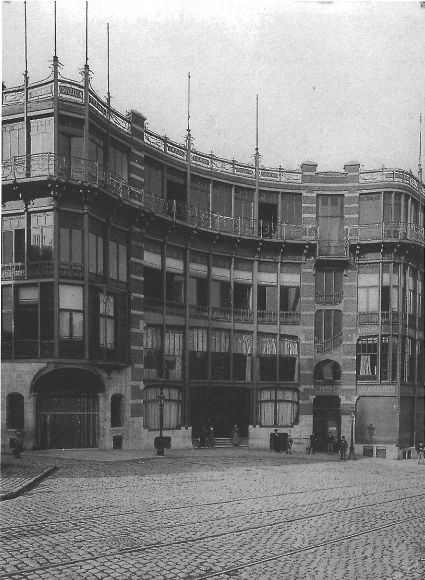
Figure 1. Façade of the Maison du Peuple, rue Joseph Stevens (just before the inauguration on 1 April 1899).