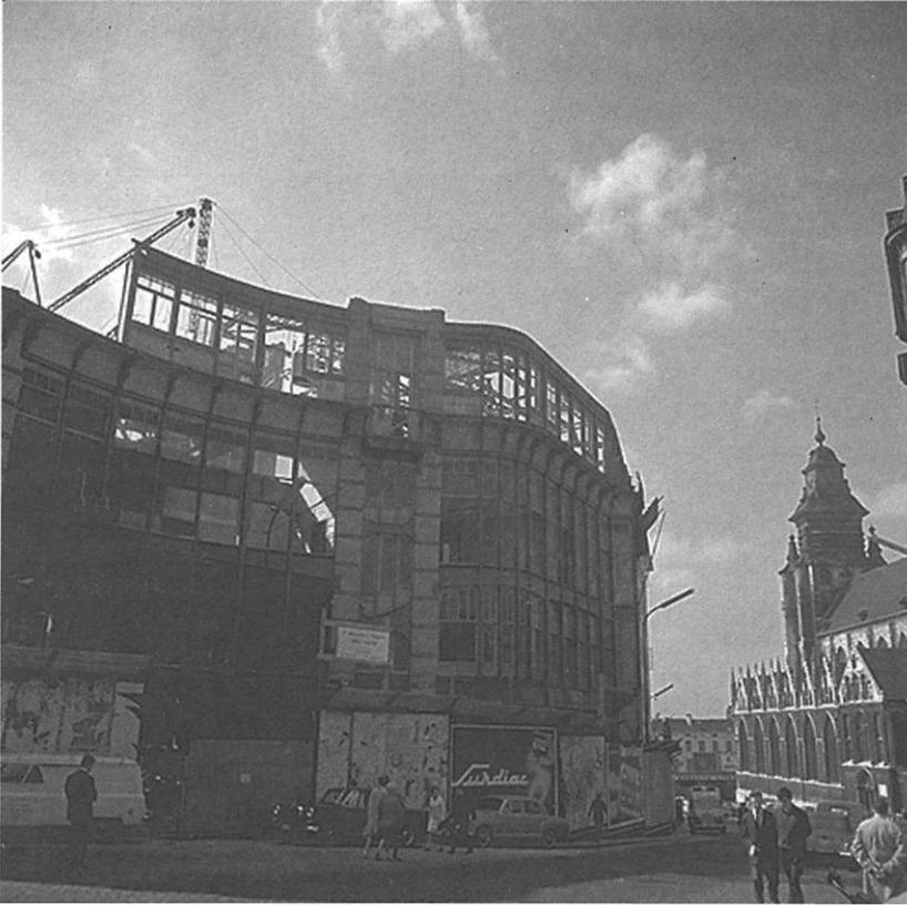
Figure 2. Façade of the Maison du Peuple during the demolition in 1965. Fondation Jean et Renée Delhaye, Musée Horta, Saint-Gilles, Brussels. Photo Jean Delhaye. © 2002-Horta/SOFAM-Belgium.

tion: "Victor Horta in handen van Frankenstein," ["Victor Horta in the Hands of Frankenstein"], for "only Frankenstein brings the dead back to life." 21 Sadly, the Maison du Peuple is now much more alive in the hundreds of photographs taken by the architect Jean Delhaye in 1965, right before its demolition, than it is in the Antwerp complex (see Figure 2). 22